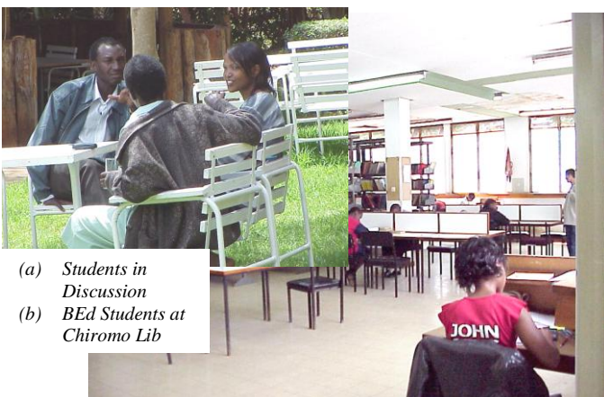
(a) Students in Discussion (b) BEd Students at Chiromo Lib