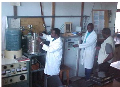
Some of the research facilities in CBPS